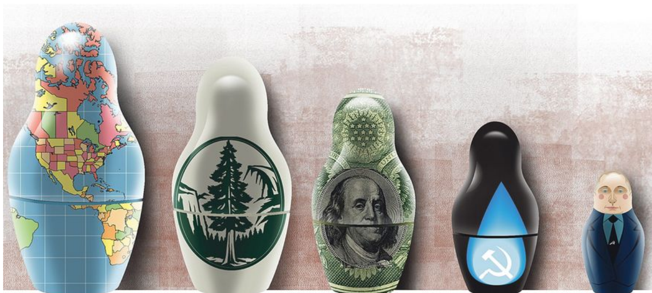
Illustration on Russia's interference with global energy production by Linas Garsys/The Washington Times more >

Putin funds environmental groups to block U.S. oil and gas production